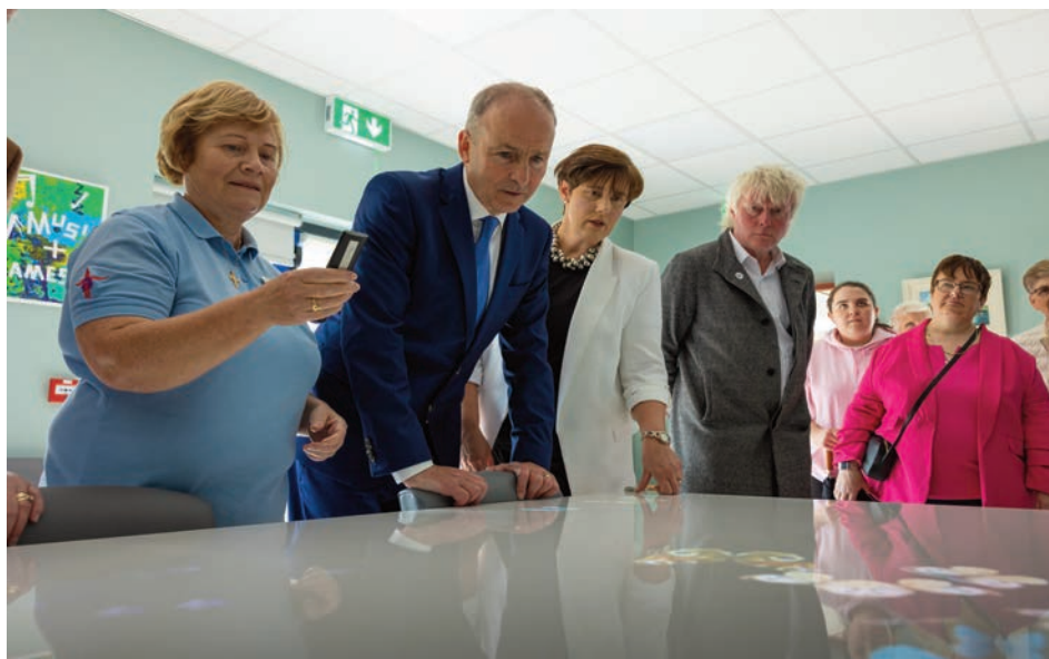
Photo: An Tániste Michéal Martin TD & Minister for Education Norma Foley TD observing a demonstration of the magic table in the Fuschia Centre

The Fuchsia Centre provides a warm and welcoming service for our clients who are diagnosed with Dementia and provides much appreciated respite for their families and carers.