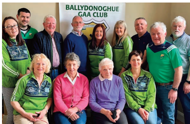
Photo: Members of Ballydonoghue GAA and Ard Chúram personel at the presentation of their coffee morning fundraiser.