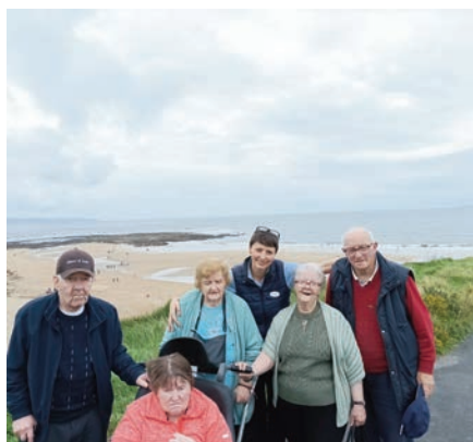
Photo: Clients Day Out