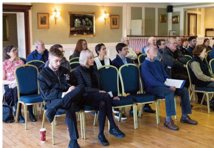
Photo: Dementia Workshop participants