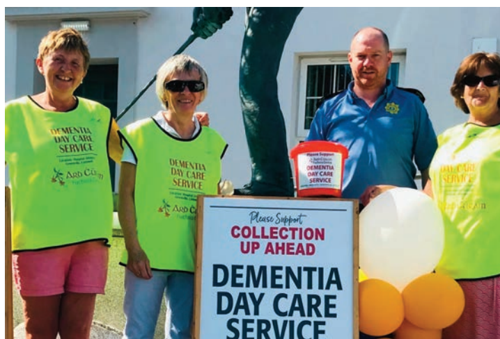
Photo: Fundraising collection in Ballybunion